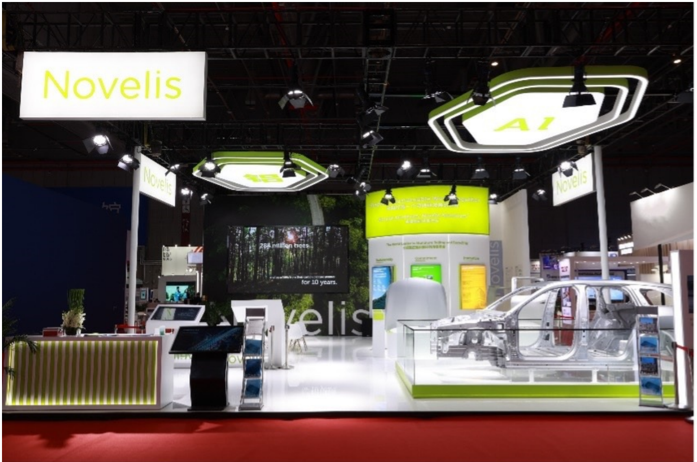
Novelis will showcase its portfolio of cutting-edge automotive aluminum solutions for the local market at Auto Shanghai 2021

SHANGHAI, April 20, 2021 – Novelis, the global leader in aluminum rolling and recycling, will showcase its portfolio of cutting-edge automotive aluminum solutions for the local market at Auto Shanghai 2021, reaffirming its commitment to transforming the industry with its innovative solutions for lighter, more fuel-efficient and better performing vehicles. As part of Novelis' plan to transform the industry with more sustainable solutions, the company is planning to implement China's first world-class closed-loop recycling system in Zhenjiang, enabling recycling of aluminum and helping customers meet their sustainability targets.