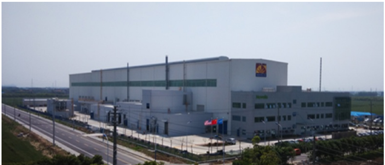
Changzhou expanding with additional investment in the second CASH line

More than a material supplier, Novelis is working closely with local automotive manufacturers at the Research and Development stage to develop next-generation vehicles that can meet consumers' increasing demands on both performance, fuel efficiency and intelligence. By taking a customer-centric innovation approach, Novelis is proactively engaged with cooperation that aligns with the trends of future-oriented development to serve our customers even better and show commitments to the development of China and world lightweight NEVs.