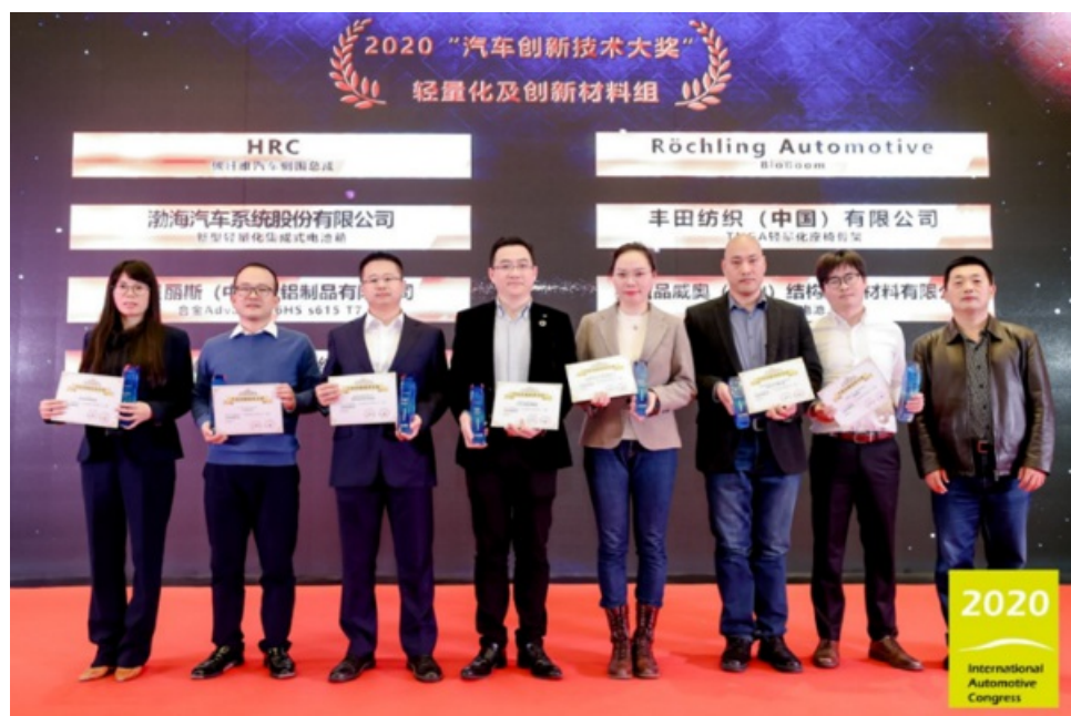
Automotive Innovation Technology Award Ceremony on Dec. 2

With the development of s615, Novelis is the first and only available supplier in Asia to provide the high strength aluminum structure product. It is currently being supplied to many of the top NEV automakers in China.